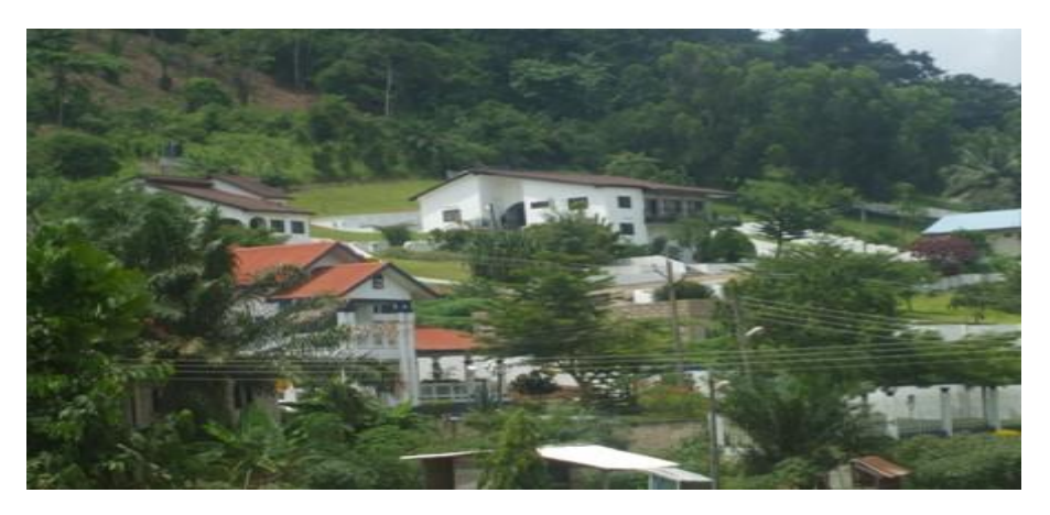
Figure 3. Posh migrants' mansions (mostly occupied by caretakers).