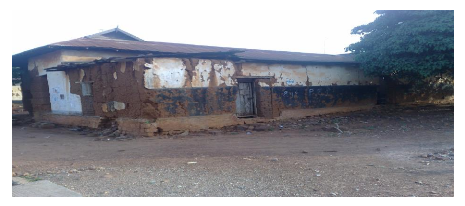
Figure 4. Rundown accommodation occupied by parents and left-behind household members of a migrant.